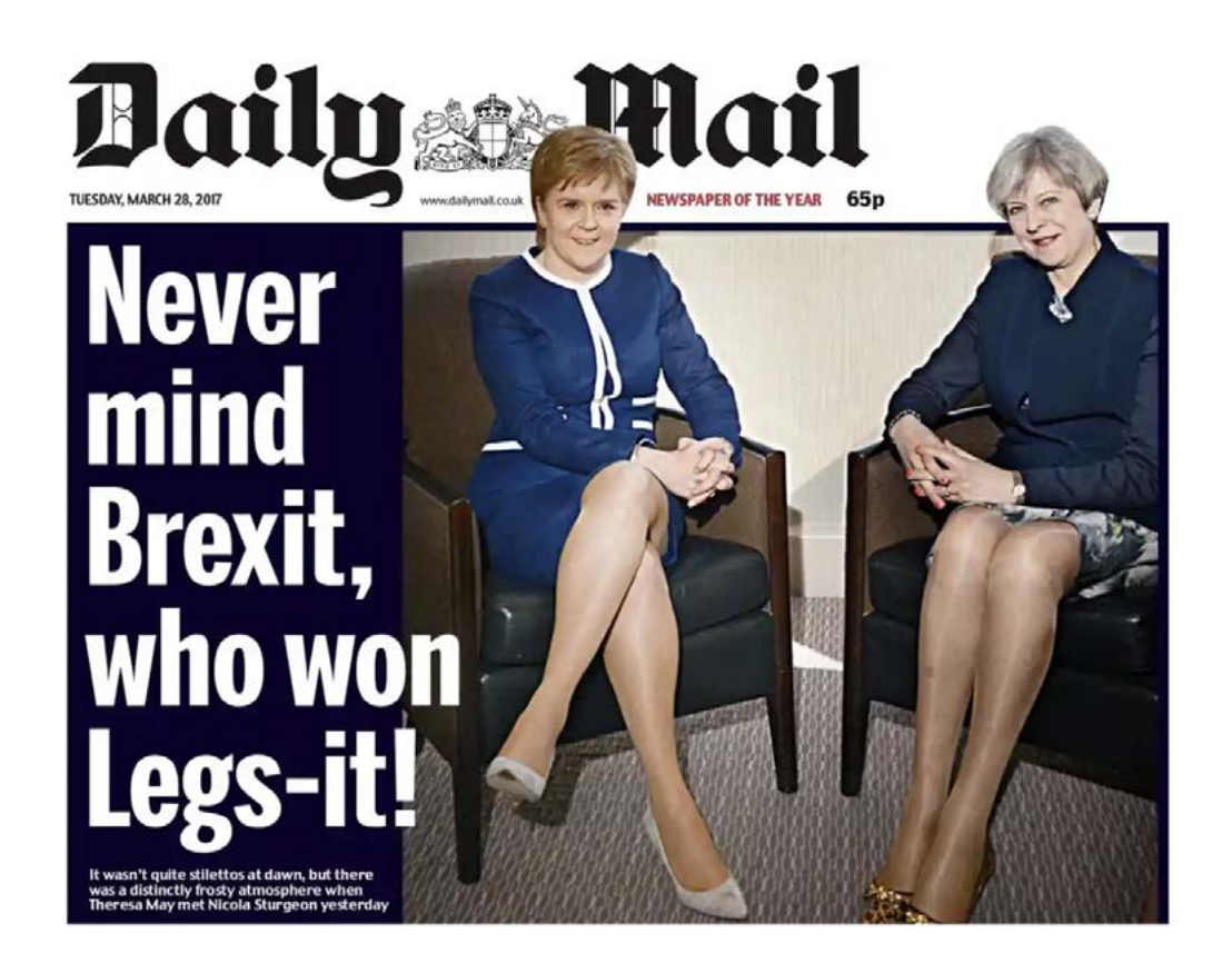
Fig. 1: A demeaning headline.

At other times, sexism comes across when women are simply erased. This happens in historical writing frequently: there is, perhaps, no phrase that erases more women than the simple but insidious 'and his wife'.